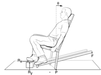
Figure 1: Experimental Setup

Twenty YA (10 females) and 20 OA (10 females) volunteers were tested (ages were 18-25 and 65-80 years, respectively). Seated subjects were asked to balance a custom high-backed chair for as long as possible over its rear legs, P (Fig. 1). Each performed five trials with eyes open. The ground reaction force under the dominant foot, which constituted the sole input to the system, was measured using a two-axis load cell. The position of three LEDs on the head and two on the chair were tracked using an Optotrak 3020 system. The error signal formed from the difference between the expected system