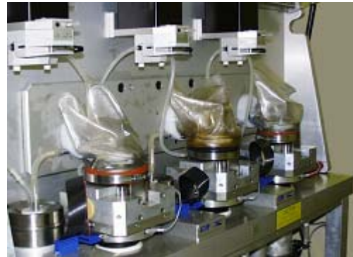
Figure 1: AMTI knee wear simulator

The test will examine two loading regimes, that of the healthy person, referred to as normal, and that of the post-operative TAR recipient. The normal load scheme will be examined since the ultimate goal of orthopaedic manufacturers is to return normal function to TAR recipients. Post-operative loads and ranges of motion will also be examined in order to be able to compare these test results with the clinical retrievals.