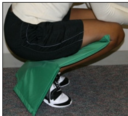
Figure 1: Experimental data collection

The supplied software (Advanced ClinSeat, Tekscan Inc., South Boston, Massachusetts, USA) was used to record the pressure distributions and calculate the centers of pressure and total forces at the thigh-calf and heel-gluteus contact areas.