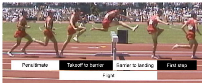
Figure 1: Step definitions.

Two Canon Elura 60 digital video cameras were placed around the third barrier at the 2007 USA Track and Field Nationals men's and women's steeplechase finals. A survey pole calibration was performed to obtain three-dimensional body positioning for every lap of the top 8 finishers. We were unable to digitize every lap due to other athletes or photographers blocking camera views. However, a total of 20 jumps for the women and 33 for the men were analyzed. Barrier clearance was defined as the height of the center of mass relative to barrier height when the athlete was at the high point of the jump. Two linear regressions were performed (one each gender) of clearance height relative to the percent loss of velocity from the penultimate step to the first step after landing.