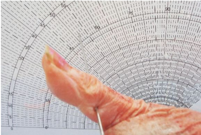
Figure 2: A K-wire through the DIP Joint (P5) was used in the experiment to measure thumb extension angle.

tendon and force was applied using known weights. The applied force, EPL displacement, and thumb extension angle were recorded. After each measurement the force was removed to minimize mechanical creep. Upon completion of the experiment in the natural position, the EPL was surgically relocated (radial to Lister's tubercle) and the experimental procedure was repeated.