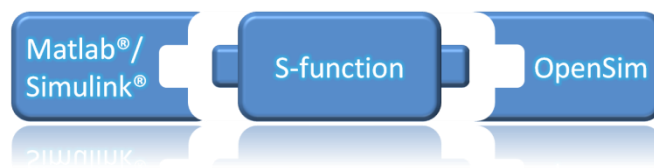
Figure 1: New S-function (system function) interface linking rapid design and control tools of MATLAB®/Simulink® with neuromusculoskeletal dynamic simulation tools of OpenSim.

We developed and demonstrated the MATLAB®/Simulink® and OpenSim interface (Fig. 1) using a three step process.