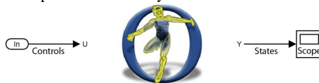
Figure 2: Generic open-loop Simulink® model using the OpenSim-based S-function interface to generate output states (e.g., kinematics) from input controls (e.g., muscle excitations or joint torques).

Second, we created a generic open-loop Simulink® model that loads and executes the OpenSim-based S-function developed in the first step (Fig.2). To demonstrate the open-loop characteristics of this model, we used a simple human arm model with 2 degrees of freedom and 6 muscle-tendon actuators. Kinematics resulting from a Simulink® simulation of elbow flexion were directly compared with those from OpenSim forward dynamics.